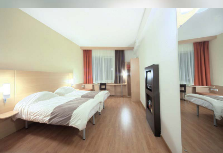
«Holiday Inn Simonovskiy»